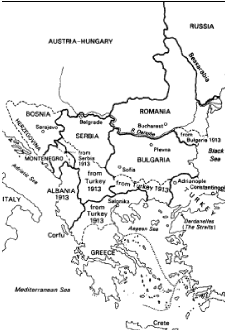
Map 1.3 The Balkans in 1913 showing changes from the Balkan Wars (1912–13)