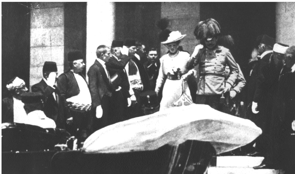
Illustration 1.1 Archduke Franz Ferdinand and his wife, shortly before their assassination in Sarajevo, 28 June 1914

The war was to have profound effects on the future of the world. Germany was soon to be displaced, for a time at least, from her mastery of Europe, and Europe never quite regained its dominant position in the world.