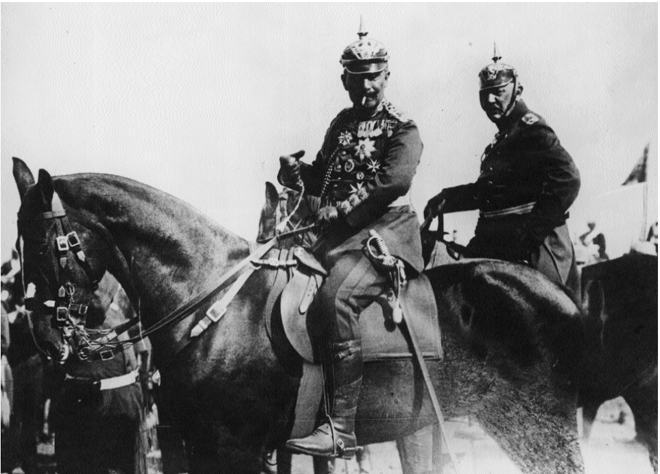
Illustration 1.2 Kaiser Wilhelm II and General von Moltke