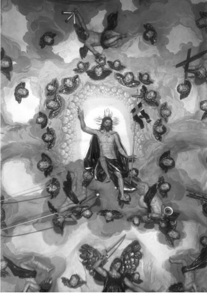
Figure 6. Christ coming in Judgment on the ceiling of the Electoral burial chapel in Freiberg Cathedral by Carlo di Cesare. Stucco.

the altar, the risen Christ above the altar outlined against the window behind, and Christ in judgement on the ceiling together sum up the Lutheran belief in the next life and the triumph over death that is vouchsafed to those who are justified by faith.