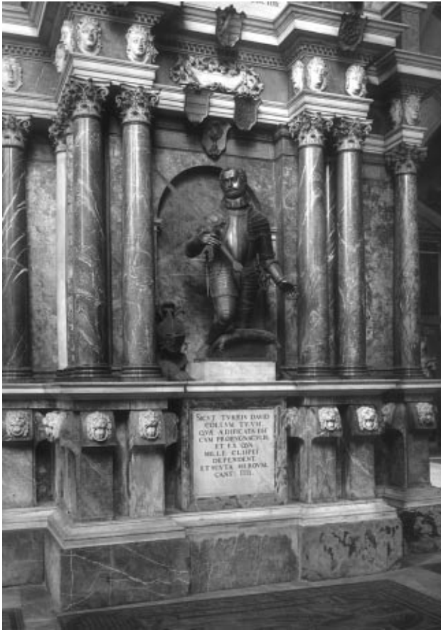
Figure 5. Kneeling figure of Christian I in the Electoral burial chapel in Freiberg Cathedral by Carlo di Cesare. Bronze.

holding musical instruments. The whole rises to the ceiling which, in a mix of painting and three-dimensional figures, depicts Christ coming in judgment and majesty accompanied by the Archangel Michael, the Weigher of Souls (Figure 6). These are both enormous figures, some 2.5 metres in length but foreshortened by the height at which they are placed. They are surrounded by cherubs' heads and putti blowing long, three-dimensional trumpets while other putti carry the nails, the crown of thorns, the cross, the ladder, the sponge soaked in vinegar and the pillar on which Christ was scourged. The crucified Christ depicted on