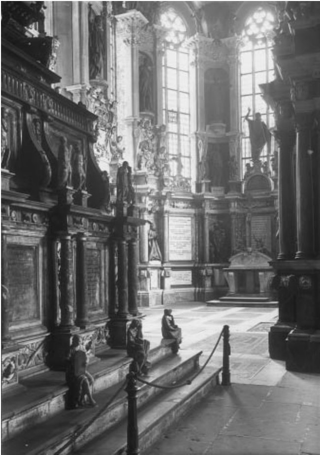
Figure 4. Electoral burial chapel in Freiberg Cathedral. The monument to Moritz is on the left.

In 1563 the monument to Moritz was placed behind the altar at the entrance to the choir, dominating the space. Some twenty years later, in 1585, on the death of Anna of Denmark, his wife of thirty-seven years, and after ten of August's children had been buried in the cathedral, August decided to turn the choir area into an official family burial chapel (Figure 4). The space was more or less fixed, for plans to pull down the choir and rebuild it completely were declared too expensive. Giovanni Maria Nosseni, the architect mentioned above in connection