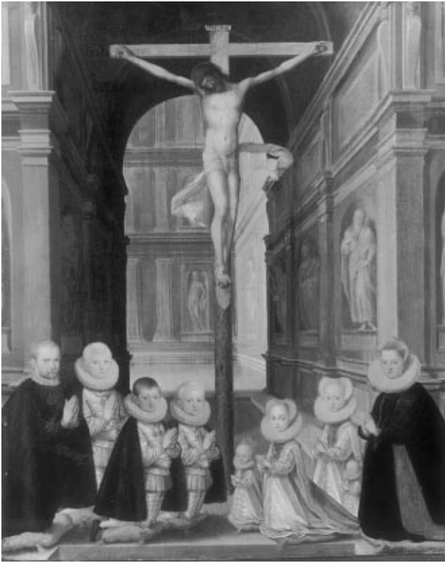
Figure 7. Zacharias Wehme, Christian I and his family, 1591. Gemäldegalerie Alte Meister, Dresden. Inv. No. MO 1951.

Church in Saxony, allowed Calvinist books to be sold in Leipzig and decreed that exorcism should no longer form part of the baptism service – a move away from Lutheran doctrine. 20 In religious matters it seems he was gradually becoming estranged from his wife, Sophie, Margravine of Brandenburg, although an official portrait belies this. Zacharias Wehme painted Christian, Sophie and their seven children towards the end of the reign in 1591 in an ecclesiastical setting (Figure 7). They are all kneeling with hands joined in prayer in what appears to be a chapel lined with statues of the saints and under a crucifix, the three boys on their father's left, the four girls on their mother's right. Here the Elector, his consort and their children are presented as the epitome of the devout Lutheran family.