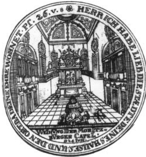
Figure 9. Medal commemorating the inauguration of the chapel in Moritzburg Castle. Johann Georg II kneels before the altar. 1672. Tenzel, Saxonia numismatica . Tab. 58, No. 1.

One of Johann Georg II's many architectural commissions was a new chapel in his hunting lodge of Moritzburg outside Dresden, designed by his chief architect, Wolf Caspar von Klengel (1630–91). The foundation stone was laid in 1661 but the chapel was not consecrated until 24 June 1672, the Feast of St John and therefore the name-day of the Elector. To commemorate the consecration Johann Georg II had a medal struck by Ernst Caspar Dürr depicting him on the obverse kneeling alone in front of the altar (Figure 9). He is dressed in his Electoral robes with the Electoral hat and sword on the ground beside him. The inscription reads: 'Herr ich habe lieb die Staedte Deines Hauses und den Ort da Deine Ehre wohnet. Ps.26.v.8' (Lord, I have loved the habitation of thy house, and the place where thine honour dwelleth). On the reverse we see Johann Georg II's motto 'sursum deorsum' and the word 'Jehovah' in Hebrew characters emitting rays of light. Beneath that is an obelisk crowned with a helmet and bearing Johann Georg's monogram. Behind it is a sword and a palm branch crossed. The inscription round the rim reads: 'Im Glauben Herr Zu Stehen Gieb Crafft und Bestaendge Christen-Lieb' (Lord, give me strength to stand firm in faith and steadfast Christian love). The initial letters of this inscription correspond to the initial letters of 'Johann Georg Herzog zu Sachsen, Gülich, Cleve und