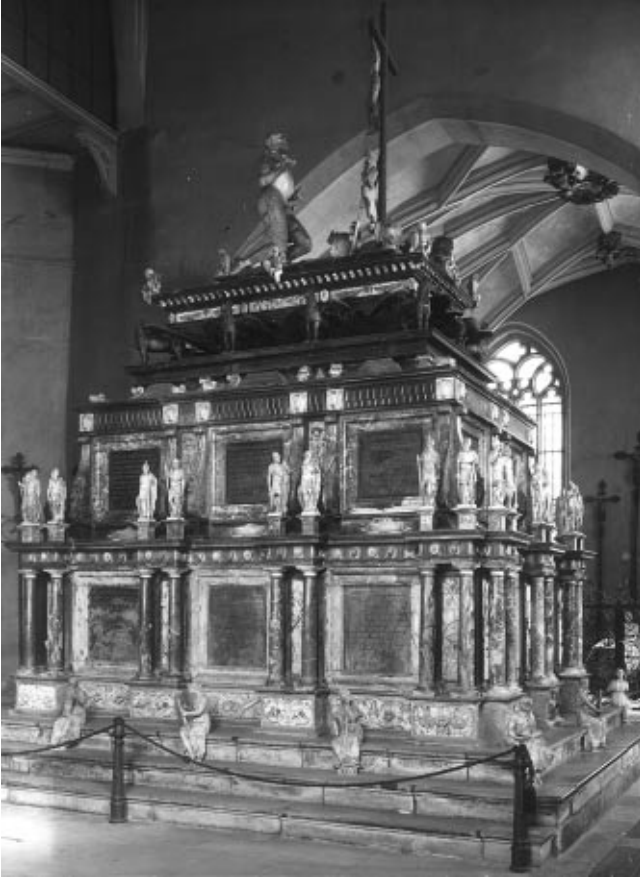
Figure 3. Monument to Moritz, Elector of Saxony, Freiberg Cathedral.

impressive structure carries a platform resting on the back of eight bronze griffons, taking the height of the monument up to some five metres. On this platform is a life-size alabaster sculpture of Elector Moritz in full armour, shouldering his sword, kneeling in front of the cross in an attitude of eternal adoration. He is represented here as the soldier for Christ, the man whose military service for the Emperor won the Electoral dignity for the Albertines. Ten of the twenty inscriptions on the plaques underline the faithful service of Moritz, his family and his brother August to the Emperor. That Moritz was killed fighting against the Emperor is glossed over. 13